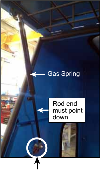
Figure 4: Gas Spring Assembly