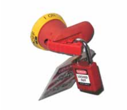
Figure 1: Lockout/Tagout on the Main Electrical Enclosure

Before performing maintenance on any machine with electrical power, lockout/tagout the machine properly. When working on a machine outside of the machine's main electrical enclosure, not including work on the electrical transmission line to the machine, follow your company's approved lockout/tagout procedures which should include, but are not limited to the steps here.